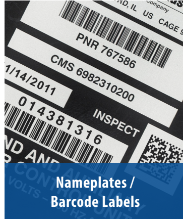
Nameplates / Barcode Labels