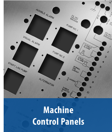
Machine Control Panels